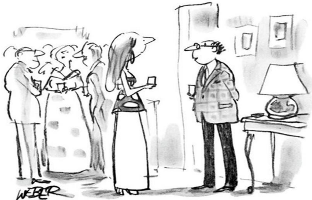
"In a way, I am kind of famous. But you've probably never heard of me unless you happen to travel in actuarial circles."